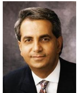
Benny Hinn Benny Hinn Ministries www.bennyhinn.org

http://www.youtube.com/watch?feature=player_embedded&v=dO84XcWgOBk