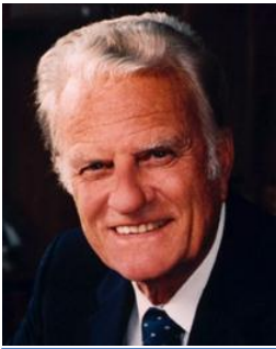
Billy Graham BG Evangelistic Association www.billygraham.org

"They [ dinosaurs ] aren't mentioned in the Bible, however, since they were extinct by the time it was written."