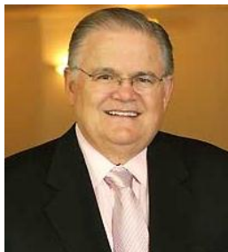
John Hagee John Hagee Ministries www.jhm.org

-Benny Hinn, Praise the Lord , TBN Broadcast, Hinn supports the Gap Theory, May 3, 2010