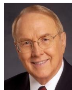
James Dobson Focus on the Family www.focusonthefamily.com