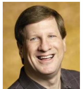
Lee Strobel Investigating Faith www.leestrobel.com

(See Lee Strobel, The Case for Faith , Zondervan, 2009, ISBN: 9780310565703)