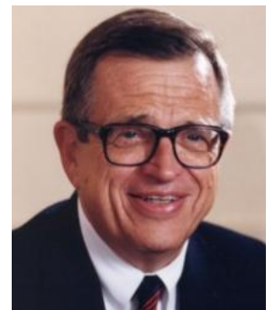
Chuck Colson Break Point Ministries www.breakpoint.com